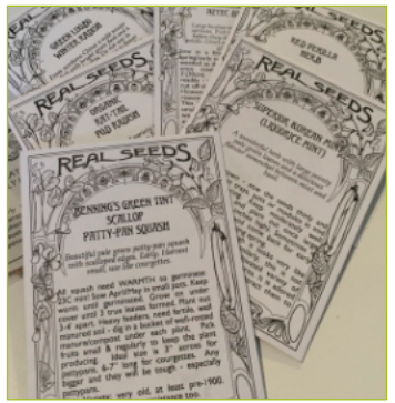
We have invested in seeds for unusual varieties.

We would love to grow a greater diversity of plants (see photo to the right), and reflecting the diets of our volunteers and garden visitors. It makes it more interesting for volunteers to try new varieties and we can learn from each other. Some of the more exotic plants might do better in our changing climate. You can help us here - let us know what you grow and how - and maybe donate some seeds to try.