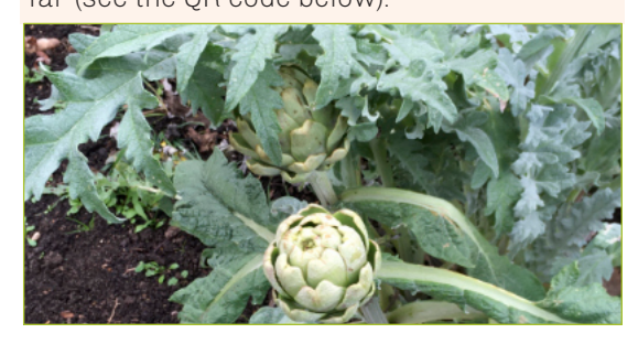
November: a 'confused' globe artichoke....

Gardening sessions: from 16 January 2022, will be held on most Sunday and Monday afternoons, from 2–4 pm, weather allowing and when co-ordinators are available. Contact the garden co-ordinators for more info (see contact box below). Check the garden website for updates before travelling far (see the OR code below).