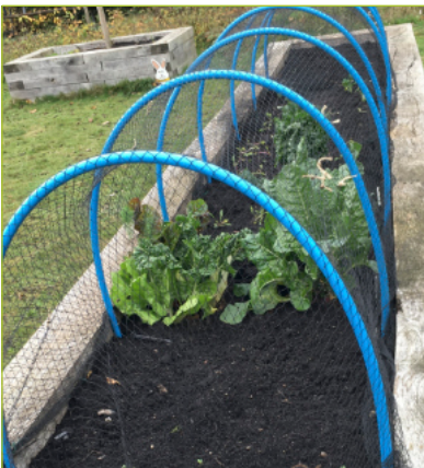
November: a first start... protecting plants (and labels) under netting.

Fourth, we need to communicate better with garden visitors. Make it clear which plants we'd like them to help themselves to -but not take too much so others can see some growing. And