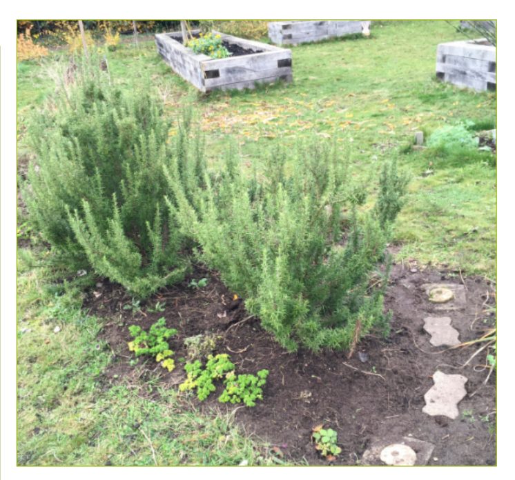
15 November: part of the new perennial herb bed, with mature rosemary plants and some biennial parsley to over-winter.

We will also think about ways to sign this bed, which is next to the oak raised beds. One of which we will use to grow annual herbs like basil, coriander, dill and parsley. This is part of our 'better produce' project (see page 2). We'd also like garden visitors to learn more, with us, about herbs. They can then help themselves to a sprig or two - either to fragrance their day/diet or to start off their own herb gardens •