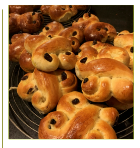
Swedish St Lucia buns, made on 13 December each year

volunteers... but we had a very happy time at each one. So, it will be lovely to meet as many people as we want this time. We have a small grant from the South Area committee of the City Council to spend on it.