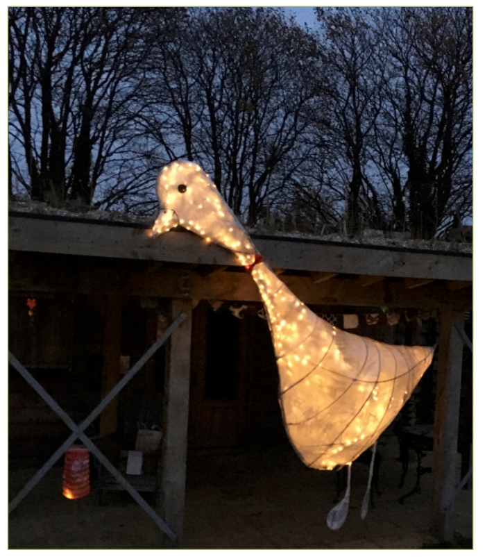
Petit Dejeuner the St Martin's Day goose welcoming people to the garden.

This was an event created by your local community - see the 'thanks' on Page 6 for a long list of volunteers. We hope to do it again next year, and maybe at a weekend so even more people can join us •